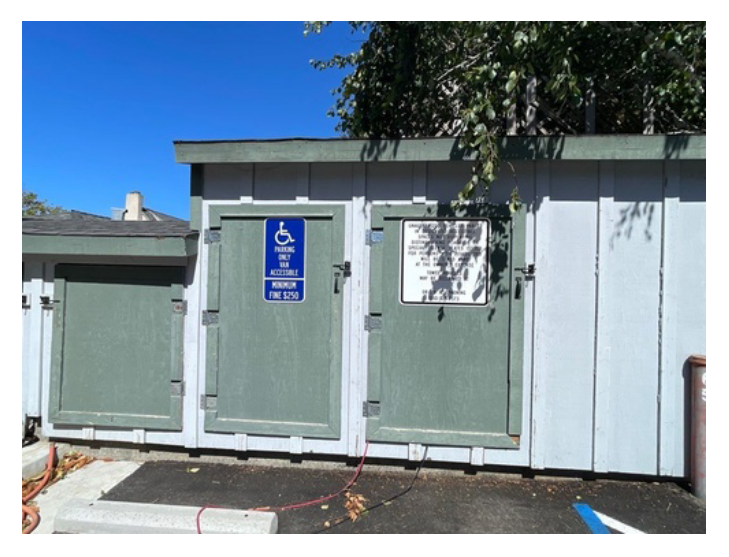
Includes option to paint shed as well. (only the two sides facing the property)