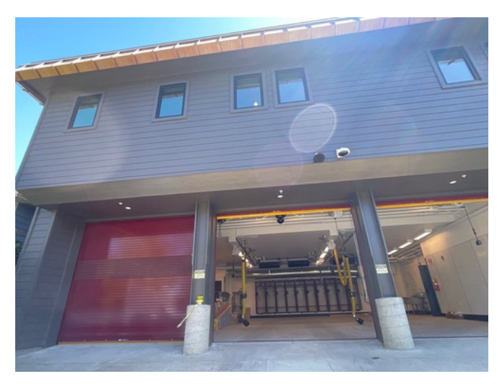
Includes painting eaves, window and door casings, and posts on building. Does not include roll up doors.