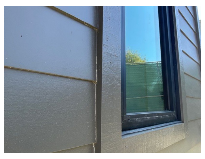
Includes adding/repairing caulking around windows and trim.