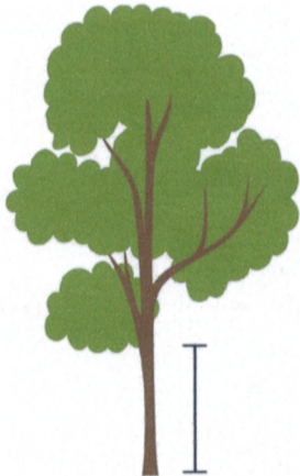
Trim all trees at least 10 feet from the ground.

You, as the property owner, are the most important person when it comes to protecting your home from a wildfire. If you need guidance in resolving a fire hazard on your property, please call the Fire Prevention Officer at (510) 215-4457 for assistance. We are happy to help!