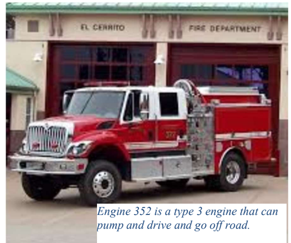
Engine 352 is a type 3 engine that can pump and drive and go off road.

Starting June 30, OES funded the staffing of a prepositioned strike team in the county in response to a heat wave, red flag days, and July 4. The strike team consisted of five type 3 engines and a battalion chief. El Cerrito/Kensington firefighters volunteered to staff E352, one of the type 3 engines, providing additional protection for our community. E352 ran out of station 52 in El Cerrito. Since the Tubbs fire (Coffee Park and Santa Rosa), OES has increased the funding of prepositioned strike teams on extreme weather days and will likely continue the practice to protect vulnerable communities. The Tubbs fire preceded a known weather event and caused 22 deaths, 5643 burned structures, and 1.3 billion in damages.