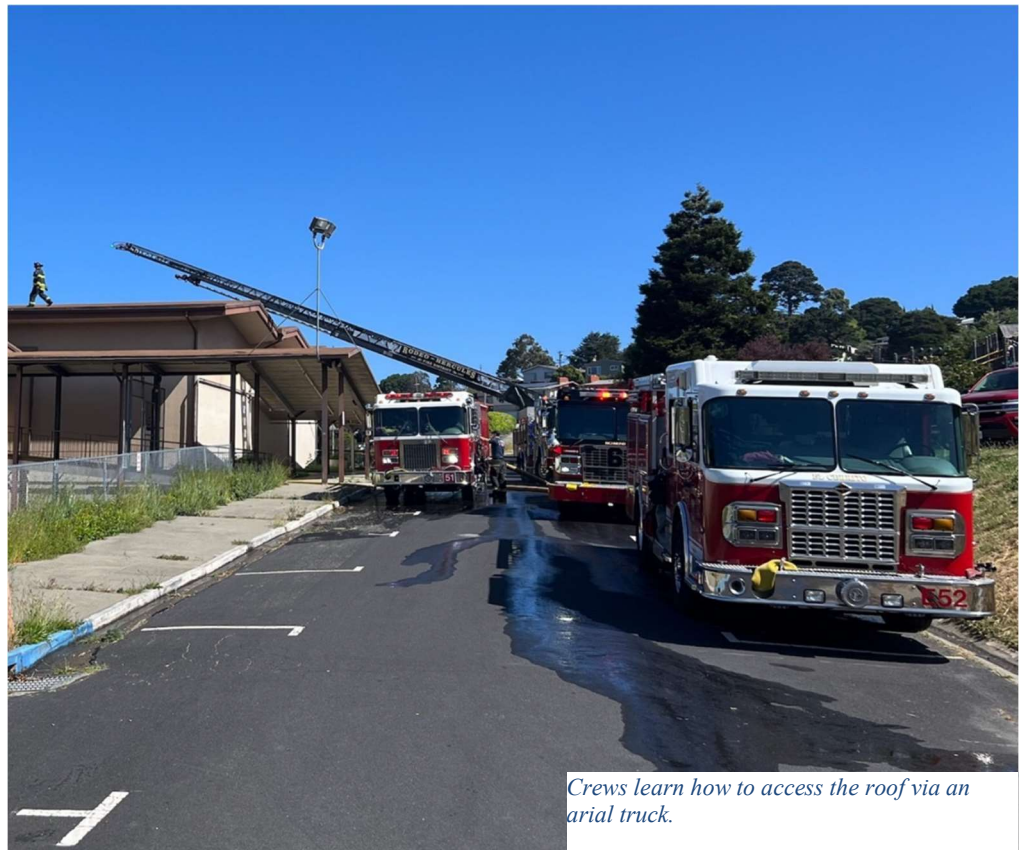
Crews learn how to access the roof via an aerial truck.

Mission: Protect Lives and Property Integrity Accountability Teamwork Respect Professionalism