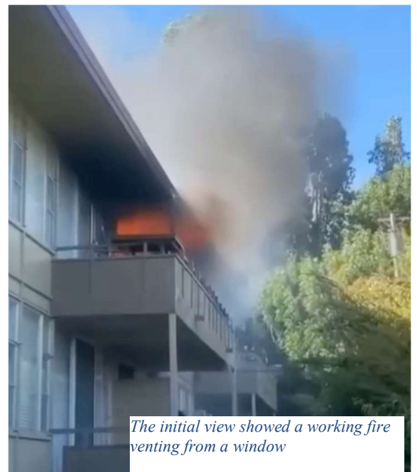
The initial view showed a working fire venting from a window

On June 10 at 4:30 pm, E51 (OES 413) and BC 5 responded to a three-story apartment fire in San Pablo as part of a first-alarm commercial fire response. On arrival, visible flames were coming from a third-floor window. The fire engines advanced hose lines into the hallway to hold the fire in check while the fire trucks performed vertical ventilation and search. The fire displaced 20 residences and significantly damaged the third floor. The intense heat in the hallway burned the skin of two firefighters; they were seen at a hospital and released. It took the combined efforts of El Cerrito/Kensington, Richmond, and Contra County fire to remove the victims of the building and suppress the fire.