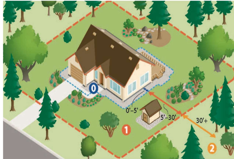
Map of Zone 0, 1, and 2

El Cerrito/Kensington fire completed its first round of lot inspections in the very high fire severity zone (VHFSZ) per local ordinances and AB 3074. Our prevention officers inspected 8,412 properties (2,199 in Kensington) and issued 144 mitigation notices. AB 3074 requires the inspections of properties in the VHFSZ according to regulations of Zone 1 and Zone 2 (California Fire Code C. 49, Veg Management sec 4906). Zone 1 regulates combustibles within 30 feet of the home, and Zone 2 regulates combustibles from 30 and 100 feet of the house. Zone 0 is intended to regulate combustibles within 5 feet of the home but has not been established by the California State Fire Marshal. The current estimate for Zone 0 regulation is late 2026.