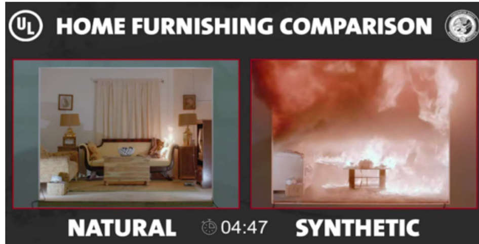
Underwriters Laboratory comparison of a legacy furniture vs modern furniture

This new standard would require the fire department to either increase minimum staffing to four-person engines, such as Berkeley Fire is currently pursuing, or wait outside until an additional unit arrives. Waiting for the next engine will significantly decrease victim survival, increase firefighter risk, and increase fire spread. Modern house fires burn hotter and faster due to synthetic materials. Flashover has increased from twelve minutes to less than five minutes.